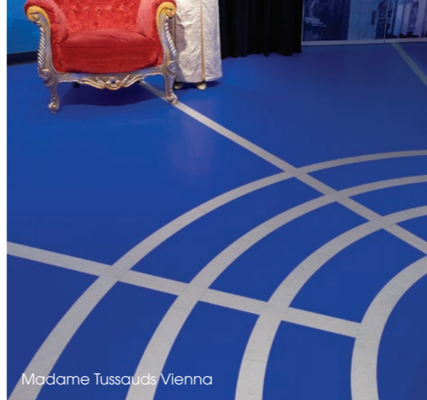
Madame Tussauds Vienna