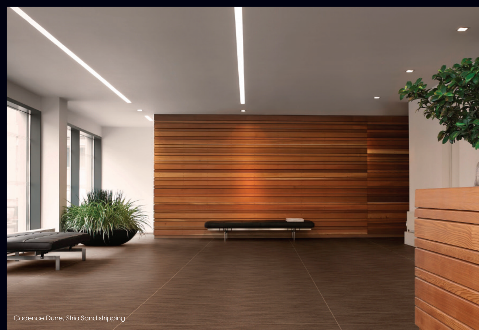
Cadence Dune, Stria Sand stripping