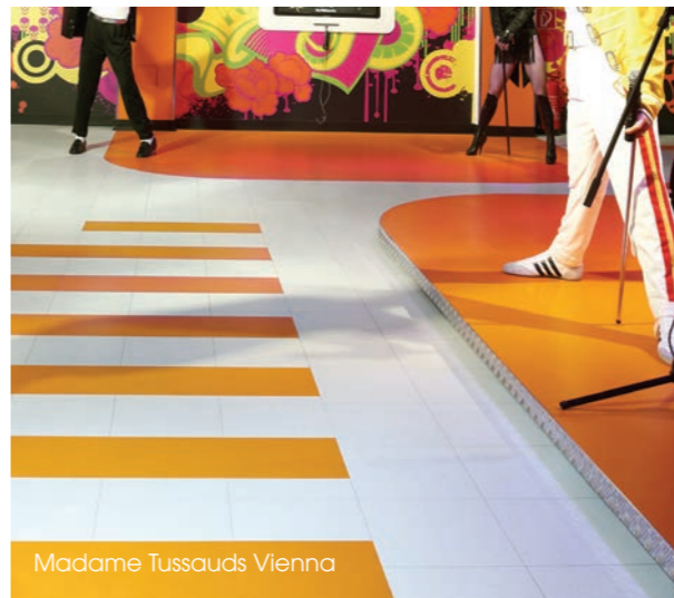
Madame Tussauds Vienna