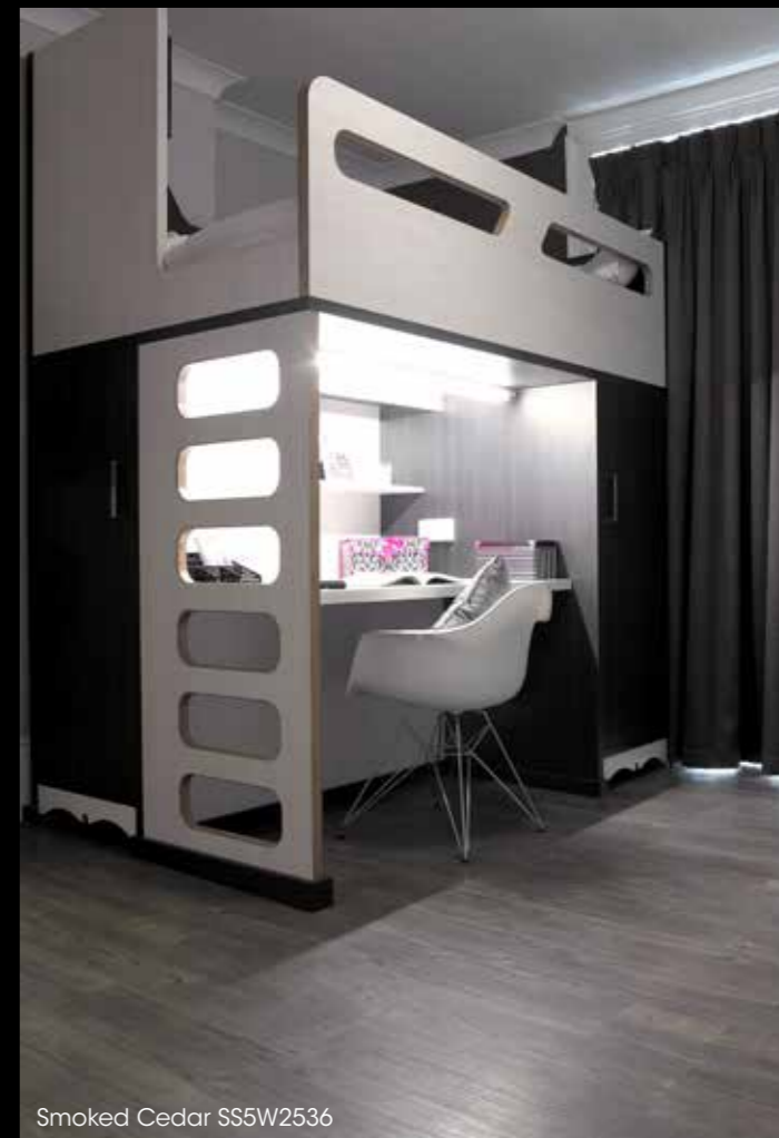
Smoked Cedar SS5W2536