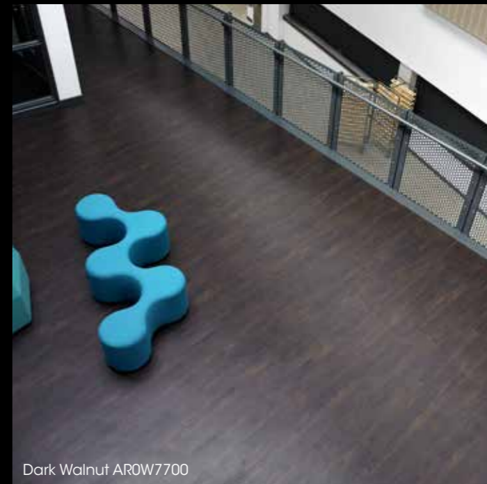
Dark Walnut AR0W7700