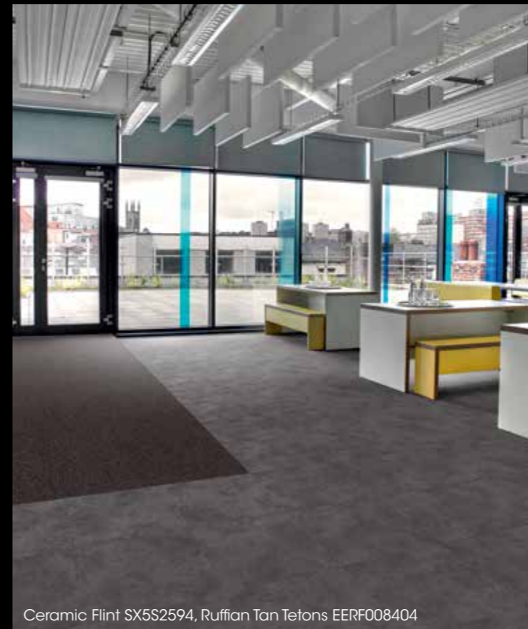
Ceramic Flint SX5S2594, Ruffian Tan Tetons EERF008404