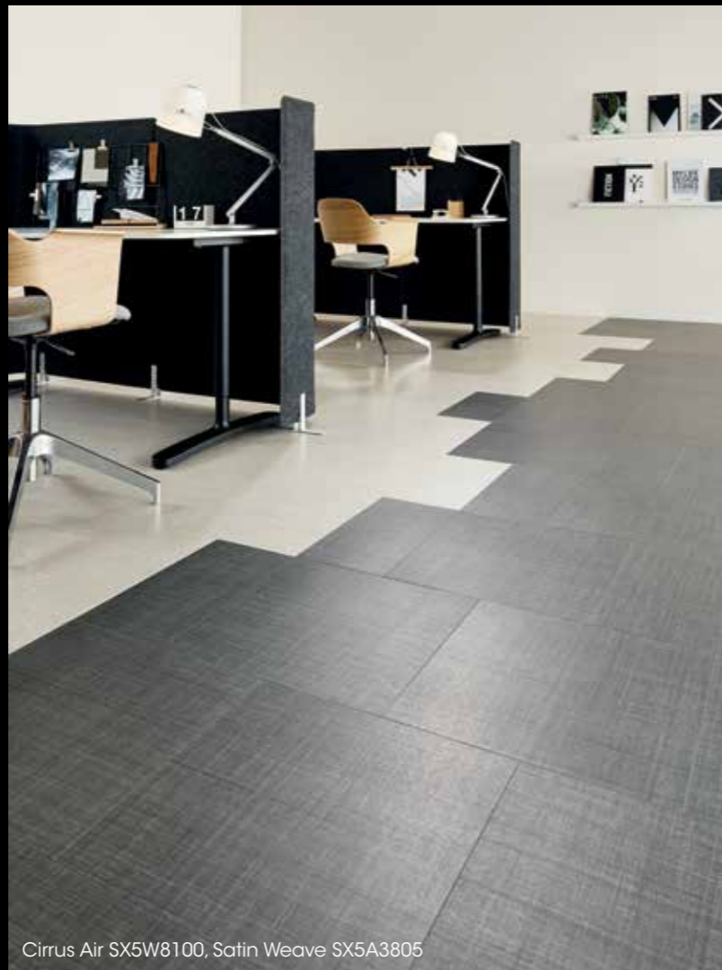
Cirrus Air SX5W8100, Satin Weave SX5A3805

Allow us to explore the options with you. Over 50 years of experience in manufacturing and designing flooring for demanding environments means we can be your next expert partner.