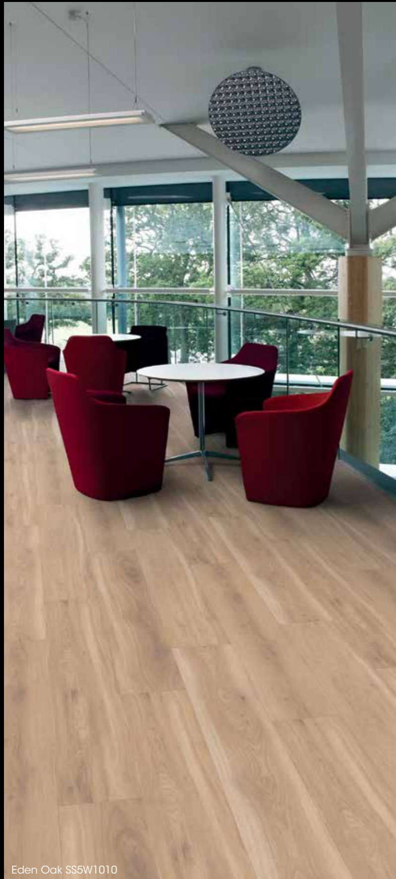
Eden Oak SS5W1010