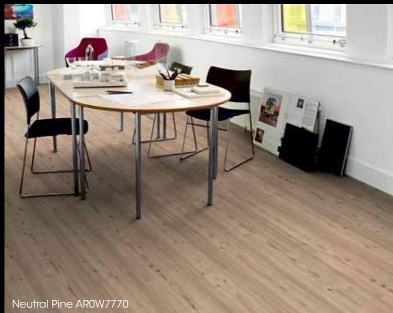
Neutral Pine AR0W7770