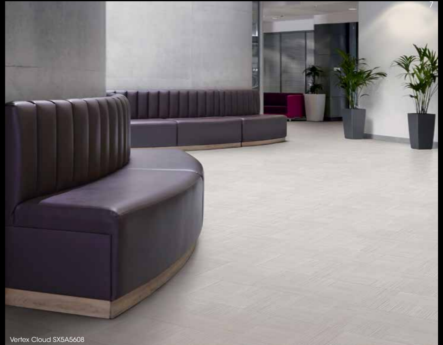
Vertex Cloud SX5A5608