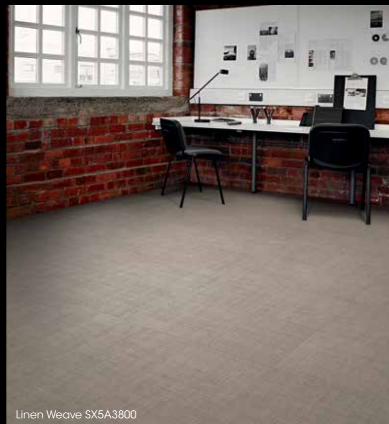
Linen Weave SX5A3800